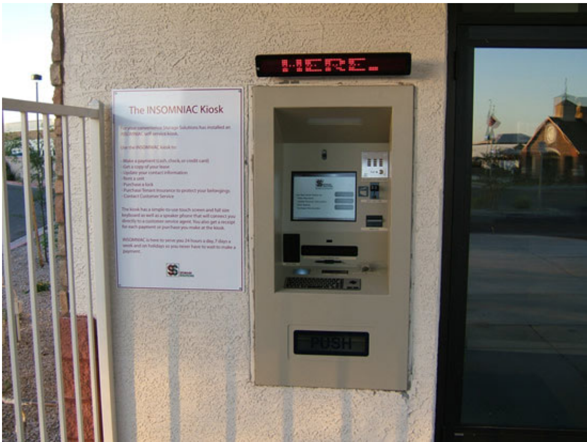
The INSOMNIAC Kiosk Now Controls Electronic Locks

The electronic locks are activated by INSOMNIAC and the facility's Syrasoft management software. In cases where a unit has been overlocked due to nonpayment, INSOMNIAC can automatically remove the overlock from the unit when the customer brings his account current using the kiosk. If a payment is made in the office, the office manager can use Syrasoft to remove the overlock on the unit.